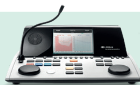
AD629 Diagnostic audiometer