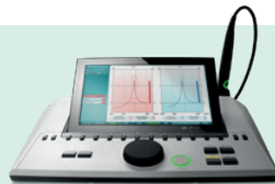
AT235 Middle ear analyzer