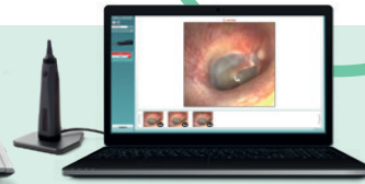
Viot™ Video otoscope